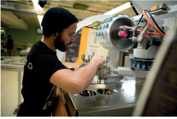
Maui Jim's fastest growing segment and biggest opportunity is its ophthalmic range.