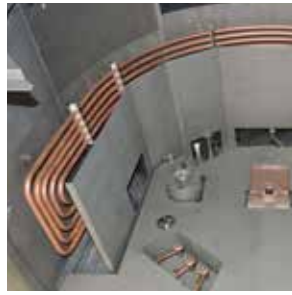
Larger Meissner trap