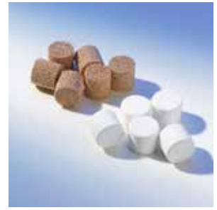
Hydrophobic and oleophobic top coatings available