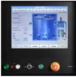
User-friendly HMI software