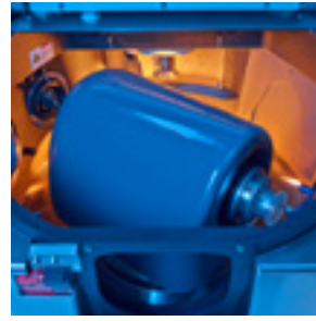
Orbital alignment of tool axes with robust work-piece spindle (B-axis).